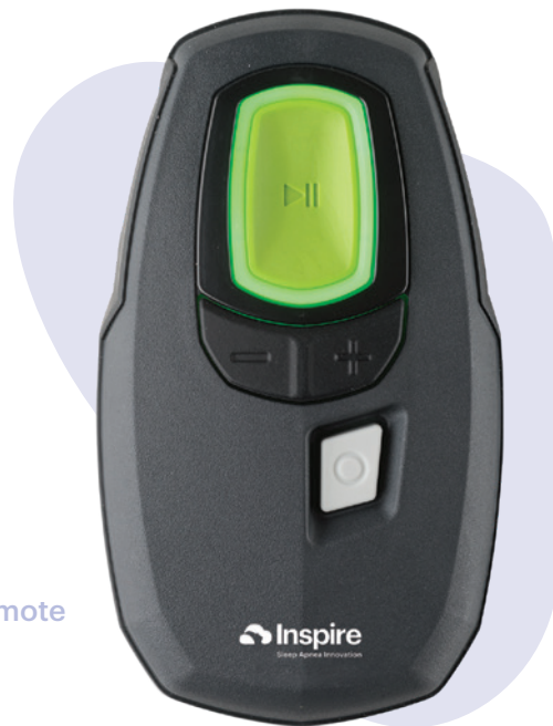
Inspire Sleep Remote

Inspire works inside your body while you sleep. It's a small device placed during a same-day, outpatient procedure. When you're ready for bed, simply click the remote to turn Inspire on. While you sleep, Inspire opens your airway, allowing you to breathe normally and sleep peacefully.