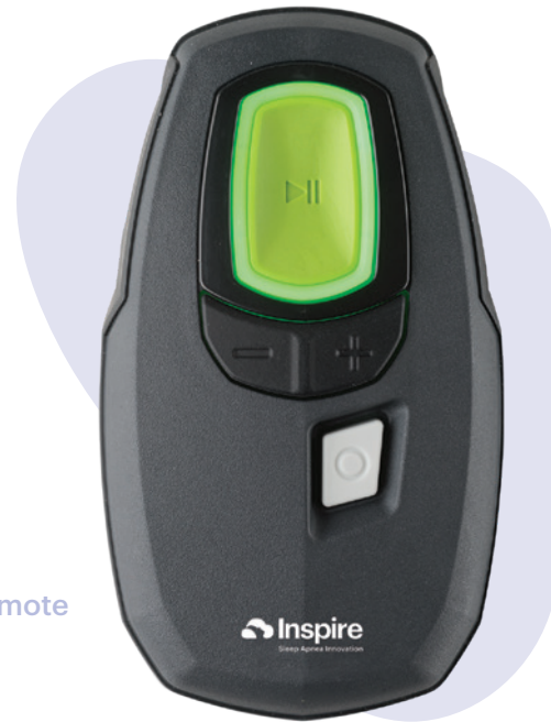
Inspire Sleep Remote

Inspire works inside your body while you sleep. It's a small device placed during a same-day, outpatient procedure. When you're ready for bed, simply click the remote to turn Inspire on. While you sleep, Inspire opens your airway, allowing you to breathe normally and sleep peacefully.